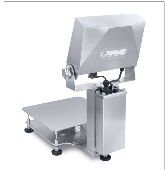
Optional External Power Bank Holder for i-D61XWE Models